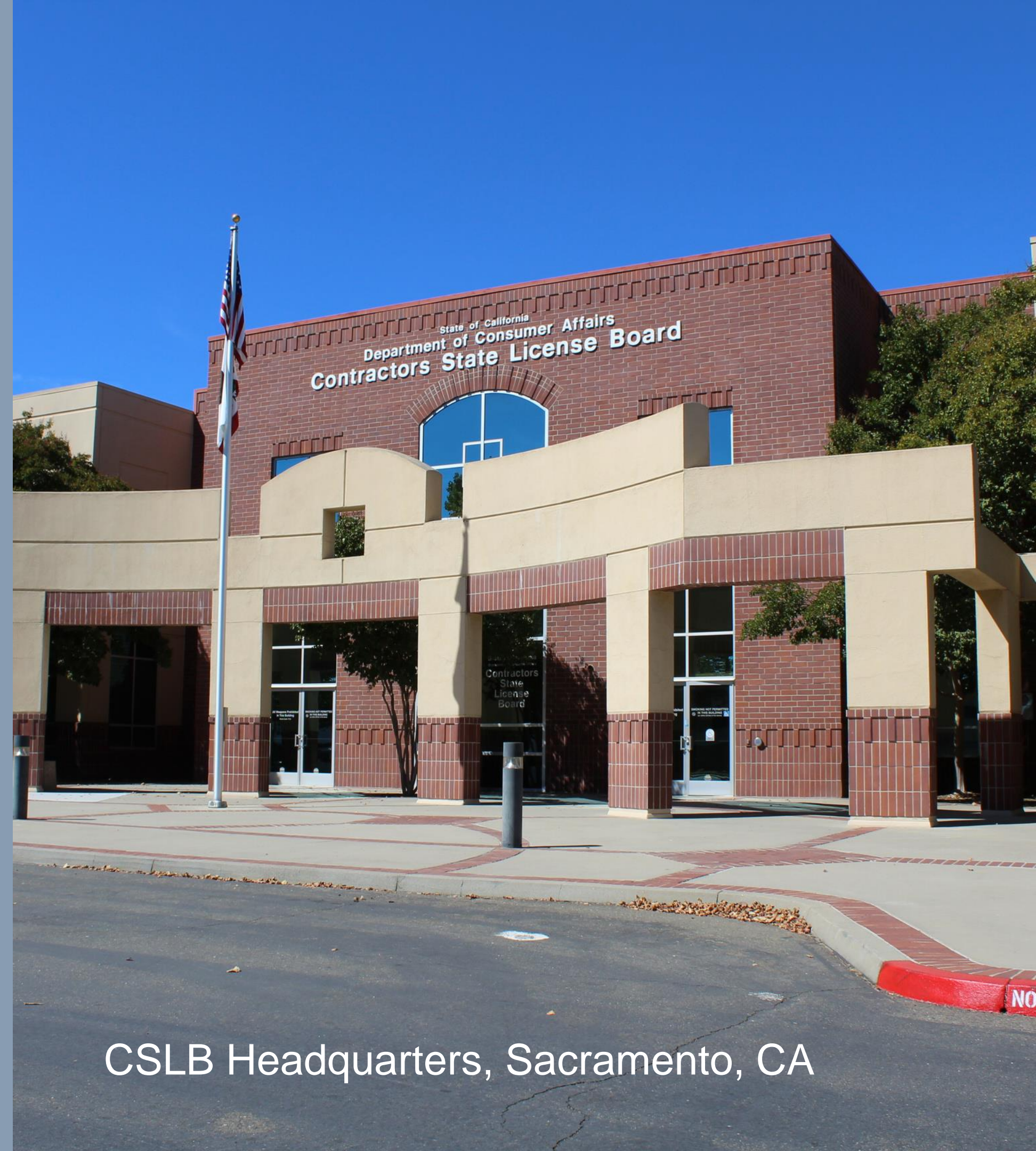
CSLB Headquarters, Sacramento, CA